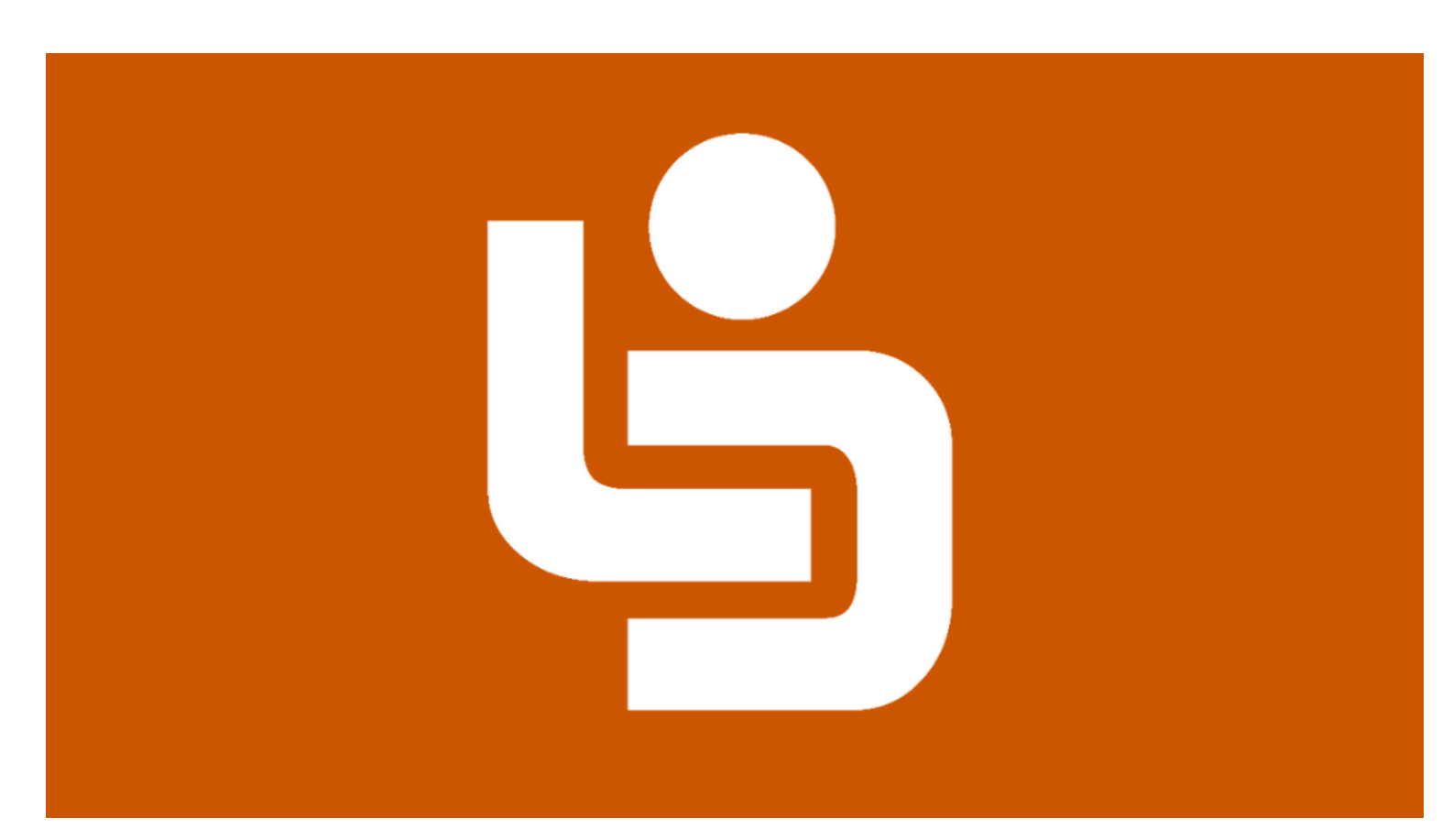
LDS Stands in Recognition of the Ongoing Legacy of Colonialism and Residential Schools in Canada

We want to acknowledge that this month's newsletter shares our achievements, including the wrap-up of our Make a Difference fundraising campaign, and celebrates another successful school year and graduating class. It is also crucial to reflect on the recent discovery of the mass grave at a residential school in Kamloops, BC, and the impact of colonialism and residential schools. We thank you for taking the time to read this newsletter and hope that you will join us in our call to action.