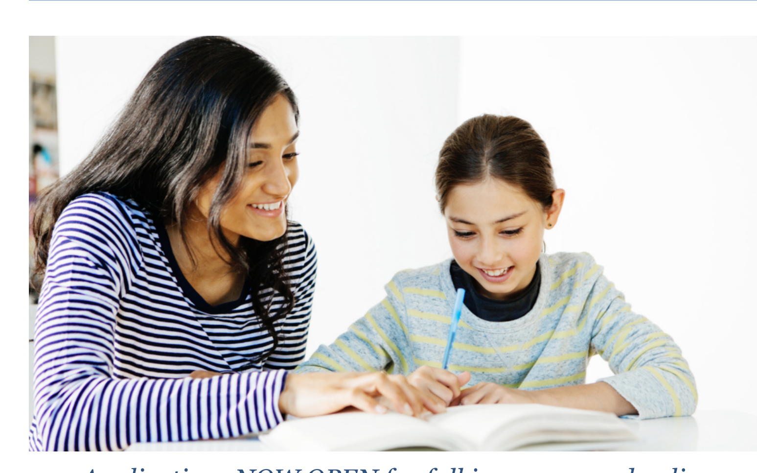
Applications NOW OPEN for fall in-person and online one-on-one instruction.

We are so excited to welcome back LDS students and families for the 2021/2022 school year. Apply now for one of our limited spots in our fall programs.