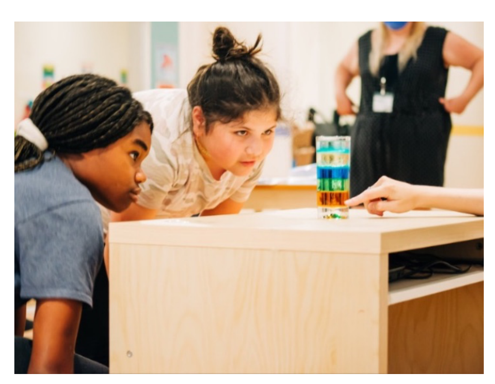
Register For Spring Break Camps!

There's always something new happening here at LDS. We are launching two new programs this spring—RISE TEAM and Spring Break Camps—and celebrating Black History Month, Staff Appreciation Week, and Pink Shirt Day.