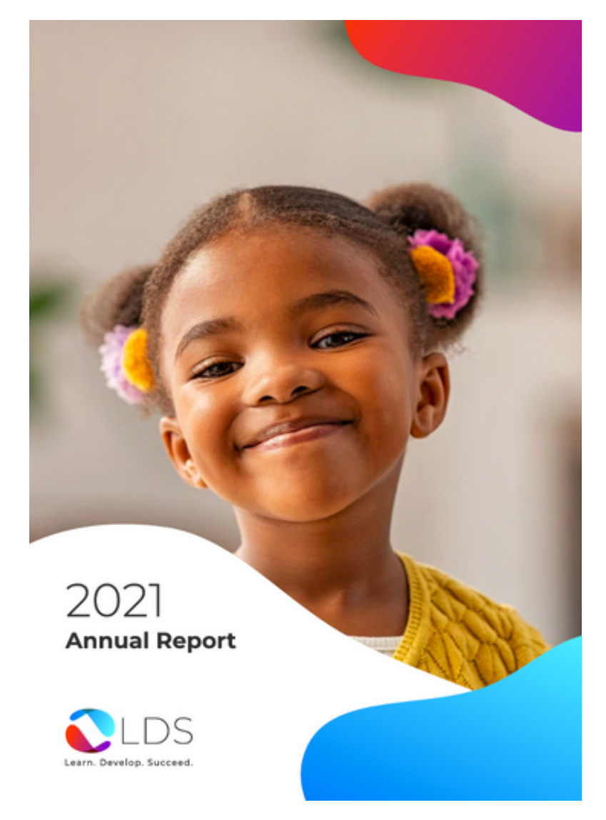
2021 Annual Report

We are delighted to share our <u>2021 Annual Report</u> with you! We encourage you to look through it to see how we have grown over the year and all the accomplishments we have achieved as a community. We are incredibly proud of the steps we have taken this past year, and we thank every one of you for being an important part of our journey.