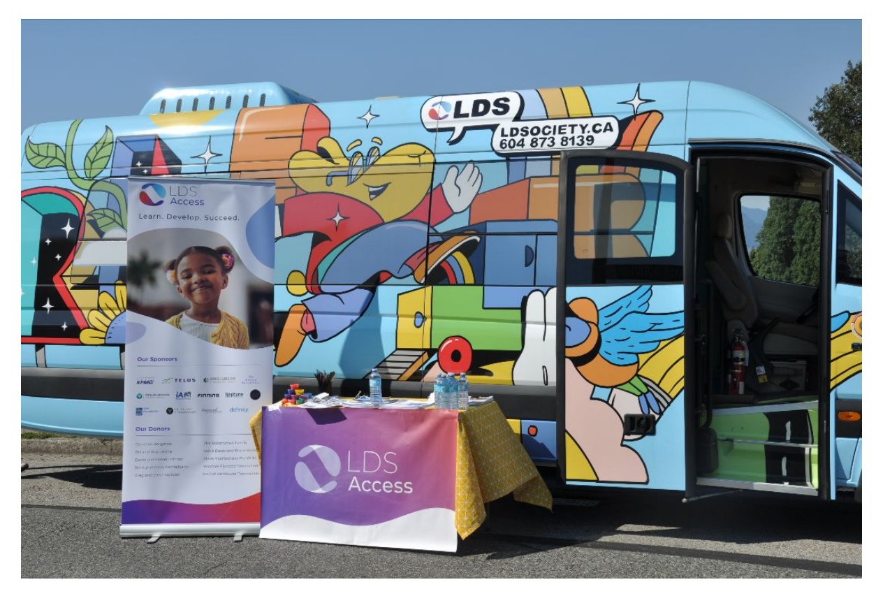
LDS Access: A mobile classroom in your neighbourhood!

Our LDS Access mobile classroom has been out in the community serving students and doing outreach all summer! We have some availability to come to your neighbourhood this autumn or winter! Get in touch at <a href="mailto:jennf@ldsociety.ca">jennf@ldsociety.ca</a> to discuss this inspiring and innovative option to bring our expert learning support to your community or school.