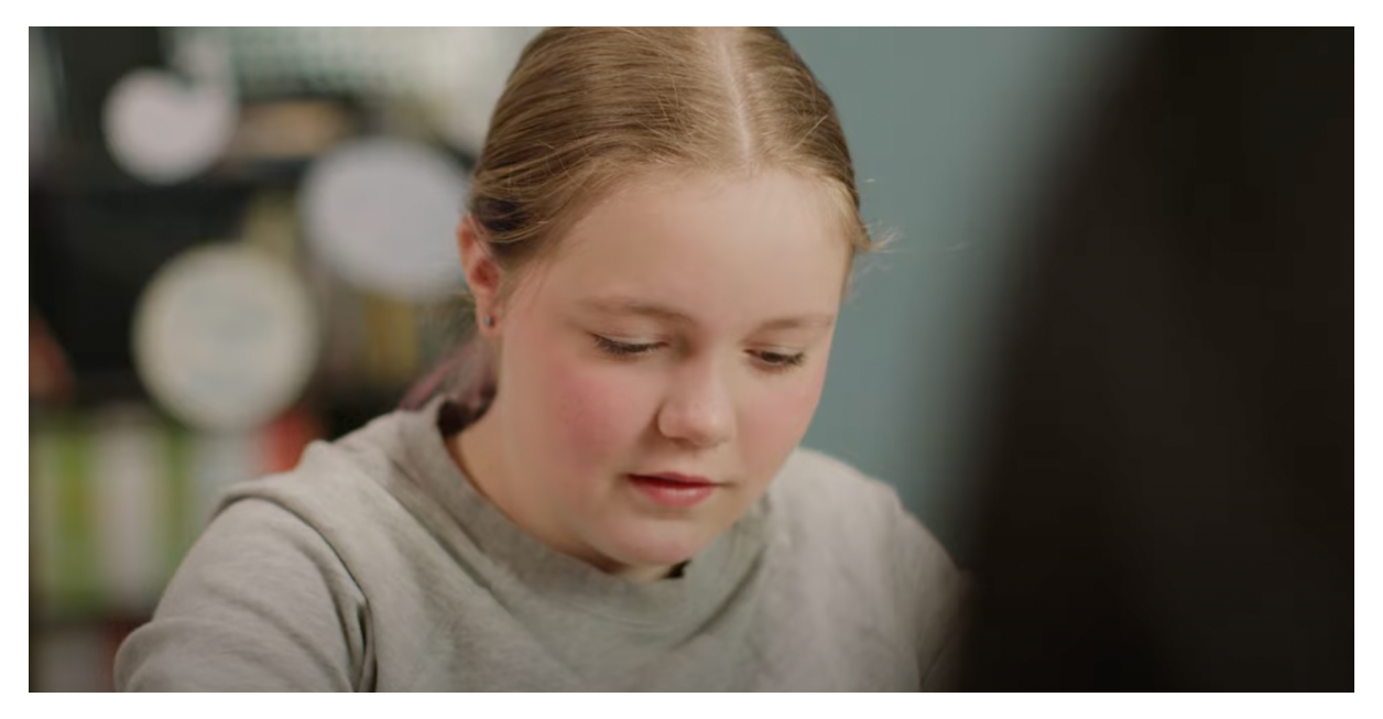
LDS Comprehensive Learning Support for Children, Youth, and Adults

Watch our new video to discover more about our holistic and transformative approach to individualized education and the comprehensive support we provide to all our learners. Find out how our 17 educational and socio-emotional programs will empower your child to build confidence and succeed in school and beyond.