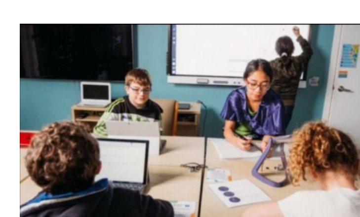
LDS's RISE-AT Program Increases Accessibility

Did you know that LDS offers a suite of assistive software tools that students and families can use from home? These programs include MindMeister, Grammarly, Read&Write, BeeLine Reader, and Live It Earth. Email us to get your free license to any of these products. To learn more, visit the RISE-AT page on our website or register to take one of our virtual software tours for an in-depth introduction to these amazing products.