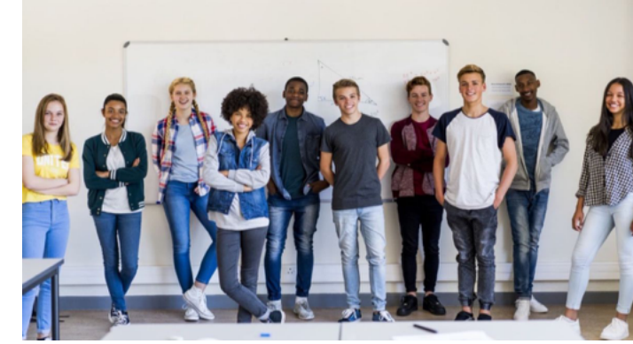
PEERS Registration Open Now!

We have formally announced the launch of our RISE Assistive Technology Program (RISE-AT) which incorporates an impressive collection of leadingedge assistive technology hardware and software tools to assist children and youth with learning differences and socialemotional challenges. Read more.